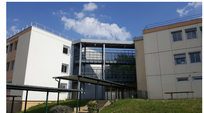
View of Pierre Brossolette Secondary School in MELUN (77)

The 5 secondary schools in the Seine-et-Marne Department are public buildings, spread over different levels varying from one establishment to another. Welcoming many secondary school students every day, these establishments must meet new regulatory requirements in terms of accessibility for people with all disabilities. So that each trip is simple and without constraints for everyone. In this context, it was necessary to bring the sanitary facilities, stairs, access ramps, elevators and appropriate signage up to standard, as well as the creation of secure fire-resistant waiting areas, in order to protect users in wheelchairs in case of fire.