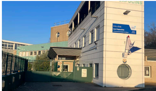
View of Les Capucins Secondary School in MELUN (77)