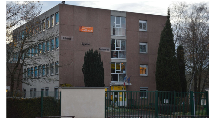
View of François Villon Secondary School in SAINT FARGEAU PONTIERRY (77)