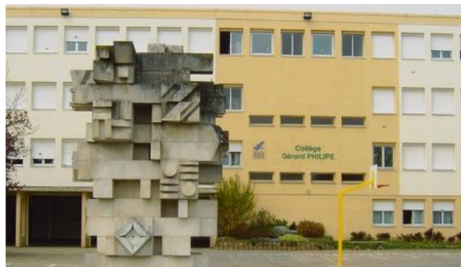
View of Gérard Philipe Secondary School in OZOIR LA FERRIERE (77)