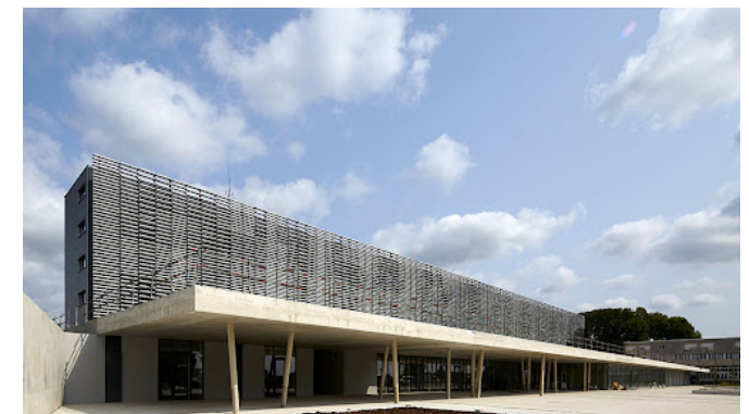
View of the Alfred Mezieres' à LONGWY

The 14 high schools in the GRAND EST Region are public buildings of around 20,000 m 2 each, spread over different levels varying from one establishment to another. Welcoming many high school and / or college students every day, these establishments must meet new regulatory requirements in terms of accessibility for people with disabilities. So that each trip is simple and unconstrained for everyone : upgrading of sanitary facilities, stairs, elevators, fire safety, ISS (fire safety system) and creation of secure waiting areas.