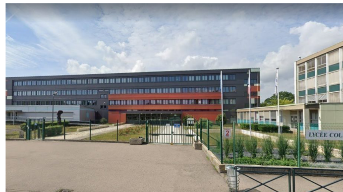
View of the Jean-Baptiste Colbert's high school in THIONVILLE