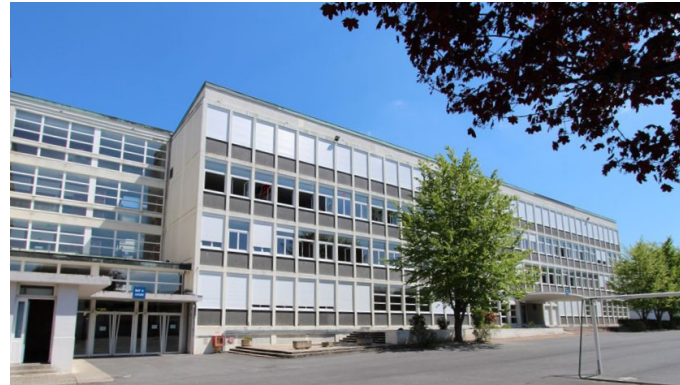
View of the Saint-Exupery's high school in FAMECK