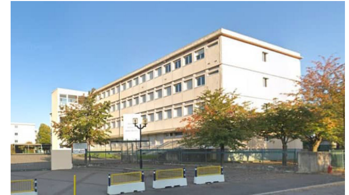
View of the Julie Daubie's high school in ROMBAS