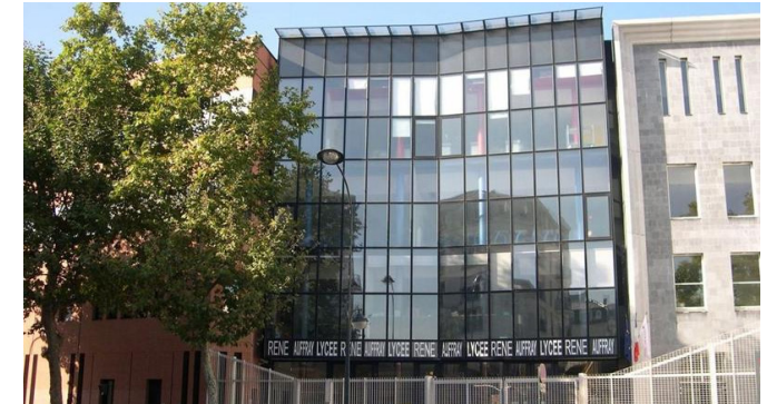
A view of the René Auffray's high school in CLICHY