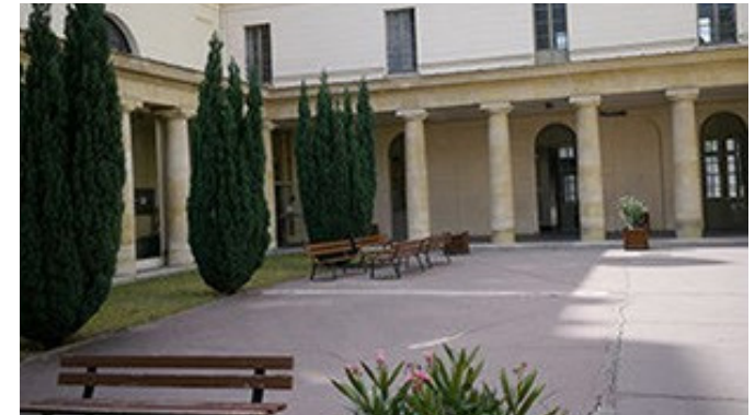
Frontage of the Kleber building

The 36 schools are about 10 000m 2 each, spread over in different levels. Welcoming each day many students, these institutions must meet the new rules and regulations in matter of accessibility, sanitary facilities, stairs, elevators and exterior joinery.