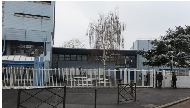
A view of the Jean Jaurès' high school in ARGENTEUIL