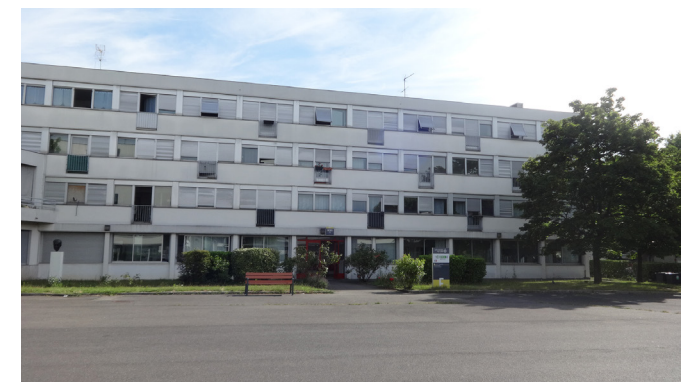
View of Paul Eluard's high school in SAINT-DENIS