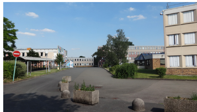
View of Jean Zay's high school in AULNAY-SOUS-BOIS