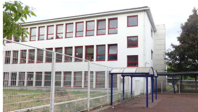
View of Frédéric Bartholdi's high school in SAINT-DENIS

Client Île-de-France Construction Durable Location Région Île-de-France Project Accessibility and fire exit study missions Design concept and follow up consultant AR ARCHITECTES, VERDI BÂTIMENT CŒUR DE FRANCE, GAYET SSI, Phœnix DB, ACAUDIT area 20 000m 2 env/établissement cost 6 238 528 € HT Date studies finished in 2018