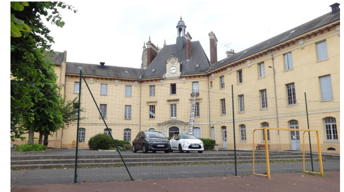
View of Henri Moissan's high school in MEAUX