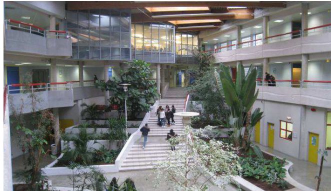
Hall of the Paul Robert school in LES LILAS