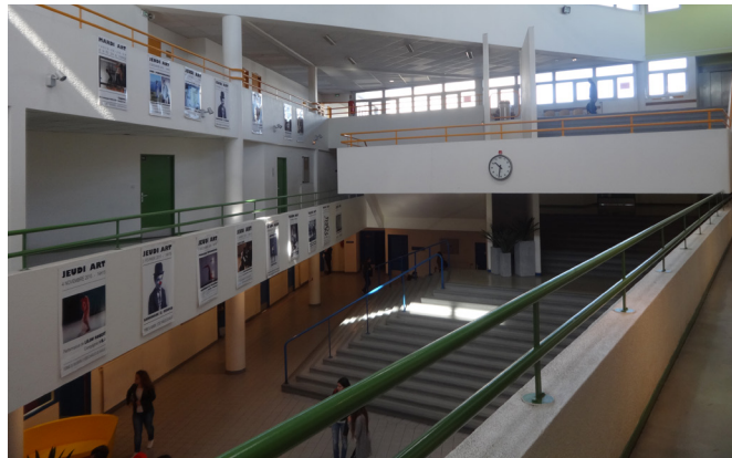
Hall of the Charles de Gaulle school in ROSNY SOUS BOIS