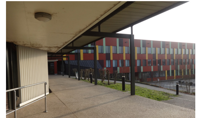
Samuel Beckett school in LA FERTE-SOUS-JOUARRE

These 12 schools are about 10 000m 2 each, spread over in different levels. Welcoming each day many students , these institutions must meet the new rules and regulations in matter of accessibility for disabled people and fire exit security.