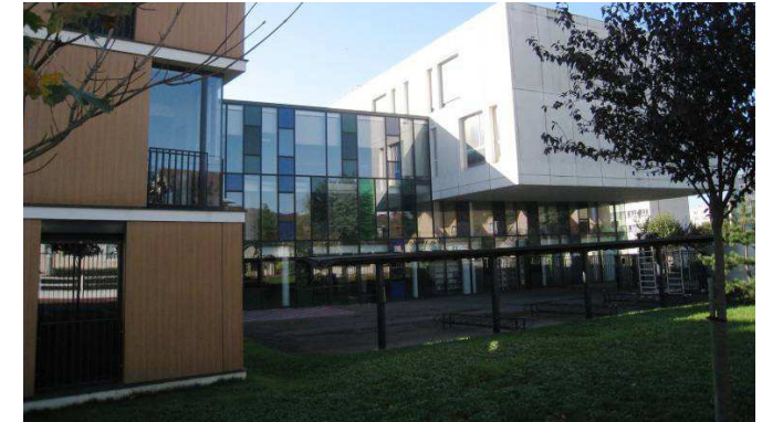
A view of the Louis Armand school in EAUBONNE