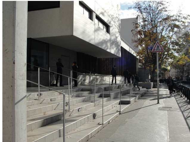
View of Jacques Prévert's high school in BOULOGNE BILLANCOURT

Client Île-de-France Construction Durable Location Région Île-de-France Project mission Accessibility and fire exit study Design concept and follow up mission consultant AR ARCHITECTES, VERDI BATIMENT COEUR DE FRANCE BEFSIA SSI and CITYACCESS area 10 000m 2 cost 4 777 054,59€ Date Work in progress