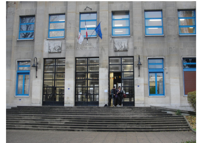
View of Claude Monet's high school, PARIS