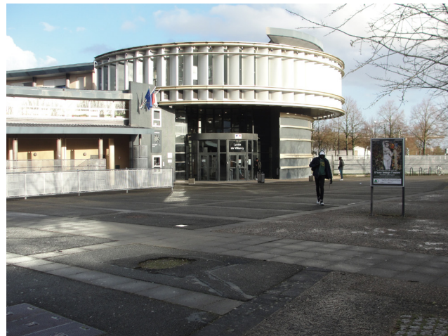
View of Villaroy's high school in GUYANCOURT