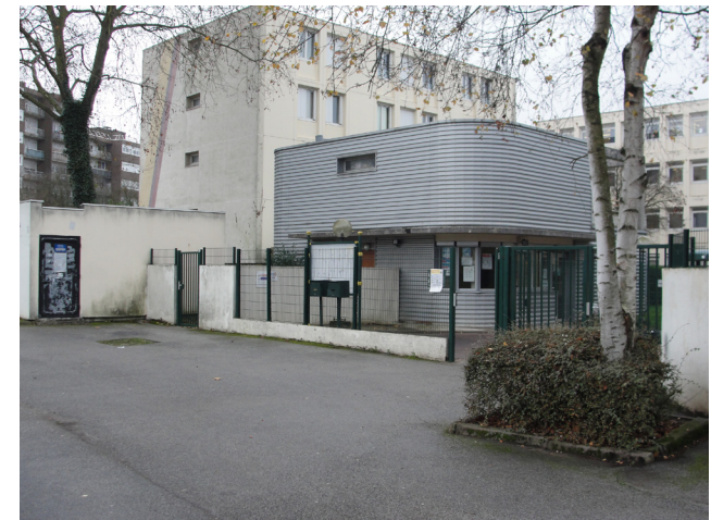
View of Louis Blériot's high school in TRAPPES

These 14 schools are about 10 000m 2 each, spread over in different levels. Welcoming each day many students, these institutions must meet the new rules and regulations in matter of accessibility for disabled people and fire exit security.