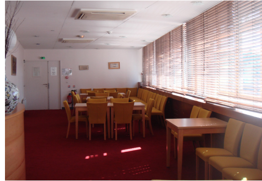
4th floor of the Crous Mabilion