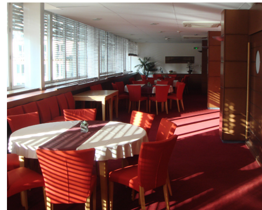
Crous Mabilion restaurant