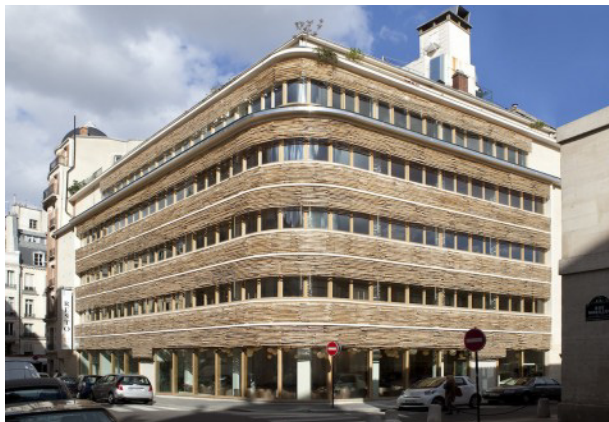
View on Crous Mabilion's building