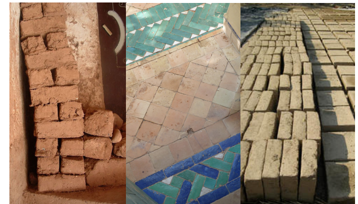
Earth and "Bejmat" construction materials

The objective is to study the local Moroccan environment and to propose solutions for sustainable design for public buildings in Morocco. The study will lead to a tutorial that will help local institutions making environmentally oriented decisions.