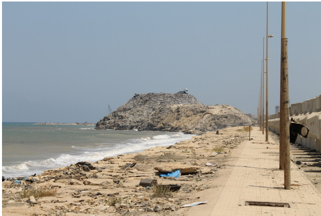
Photography of the landfield in front of the sea