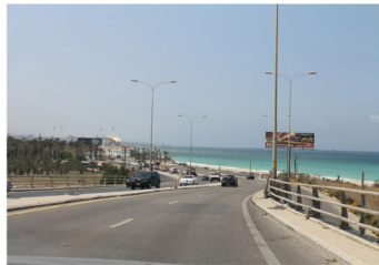
Photographie du littoral nord