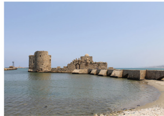
Photographie du littoral centre