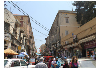
Photographie de la médina