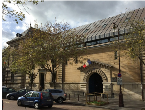
View from Place André Mignot

Client Ministry of justice Location Versailles (78) Project Refurbishment and handicap accessibility of the judicial court in Versailles consultants AR ARCHITECTES, SEREB, PHOENIX DESIGN & BUILD area 5 320 m 2 cost 274 000€ HT Date Design concept 2022