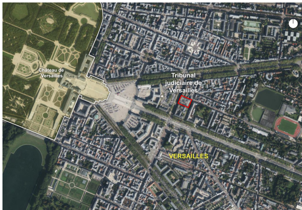
Localization of the the Judicial Tribunal