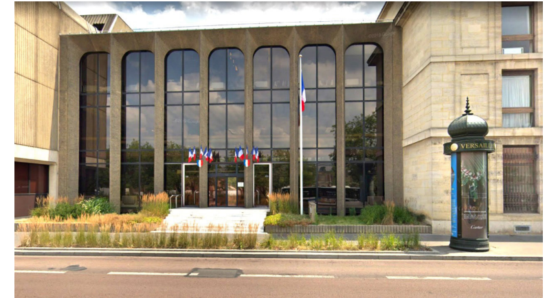
View from Avenue de l'Europe