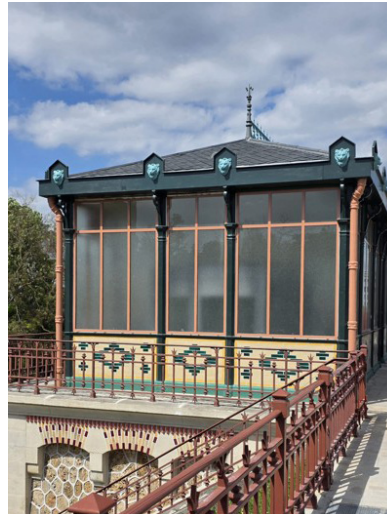
West Pavilion - Restored North Facade