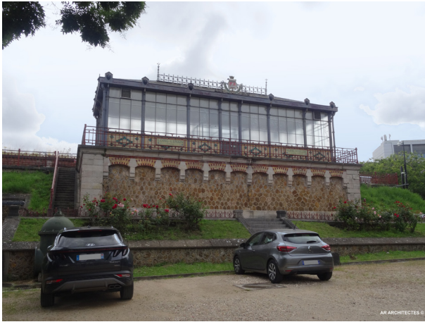
West Pavilion - West Facade - Existing state