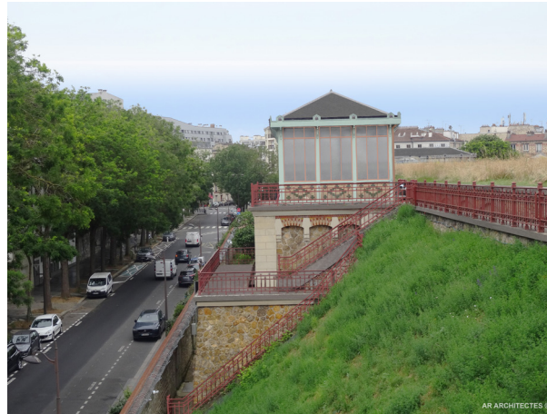
South-West Pavilion - Restored East Facade - Projected state