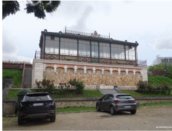
West Pavilion - Restored West Facade - Projected state