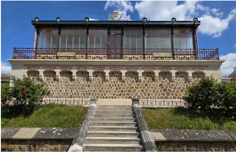
West Pavilion - Restored West Facade