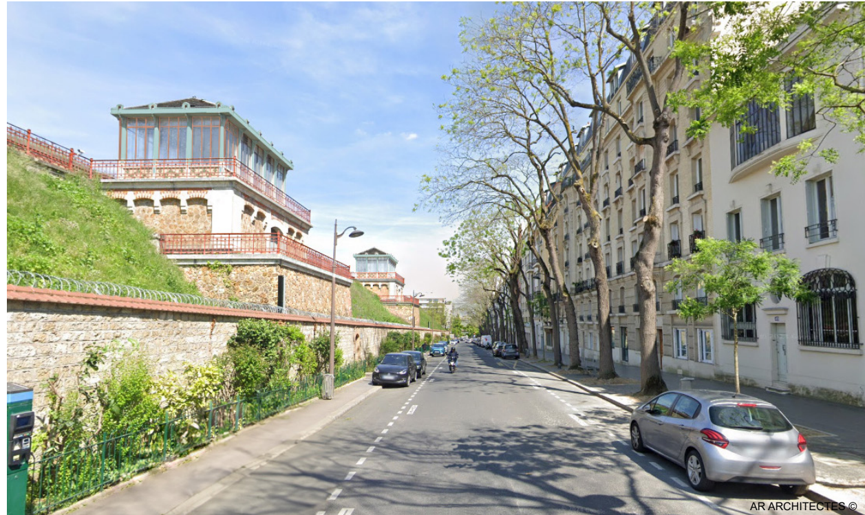
Restored South-West and South-East pavilions, Avenue Reille - Projected state