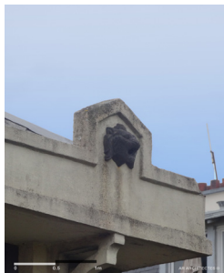
Antefixes lion heads restored to original state