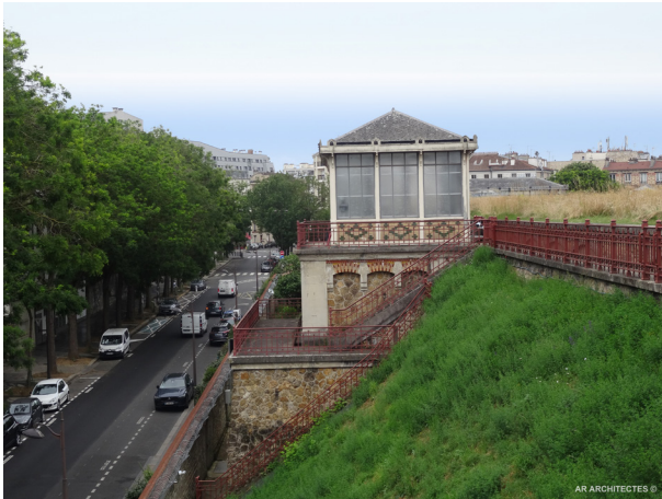
South-West Pavilion - East Facade - Existing state