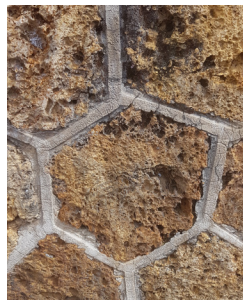
Millstone support joints restored to original condition