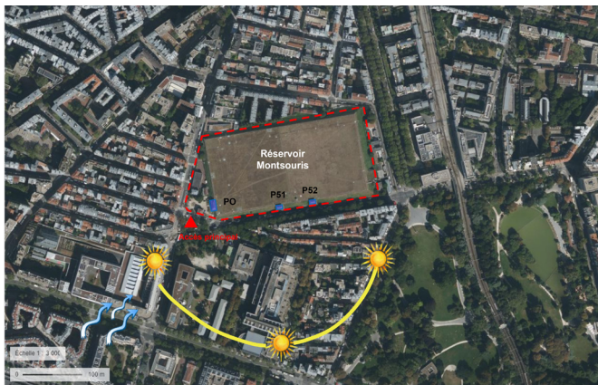
Bioclimatic mass plan of the site

The project is to restore three pavilions , constructed in early 1900, and to secure the reservoir as well as the restoration and enhancement of the built heritage . This mission aims to secure access to potable water and restore the three pavilions to their original state . A complete replacement of the joinery is planned to improve the management of the building's humidity level and increase its sustainability over time. Inside of the pavilions, each access to the water will be secured using a transparent secured glasshouse, using the architectural language of the pavilions. The exterior accesses as well as the walkway are also restored.