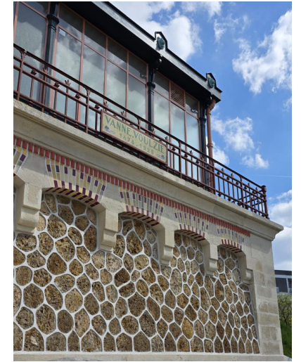
Lime plaster joints in an off-white shade of gray for the restored retaining walls, laid in a straight, geometric pattern along the contours of the rubble stones. Joints for the exterior tiling (glazed bricks, brick frieze) are finished with lime plaster in RAL 1013 (pearl white).